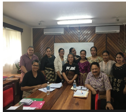
Panel members with students from TIHE Diploma in Media and Journalism Level 5