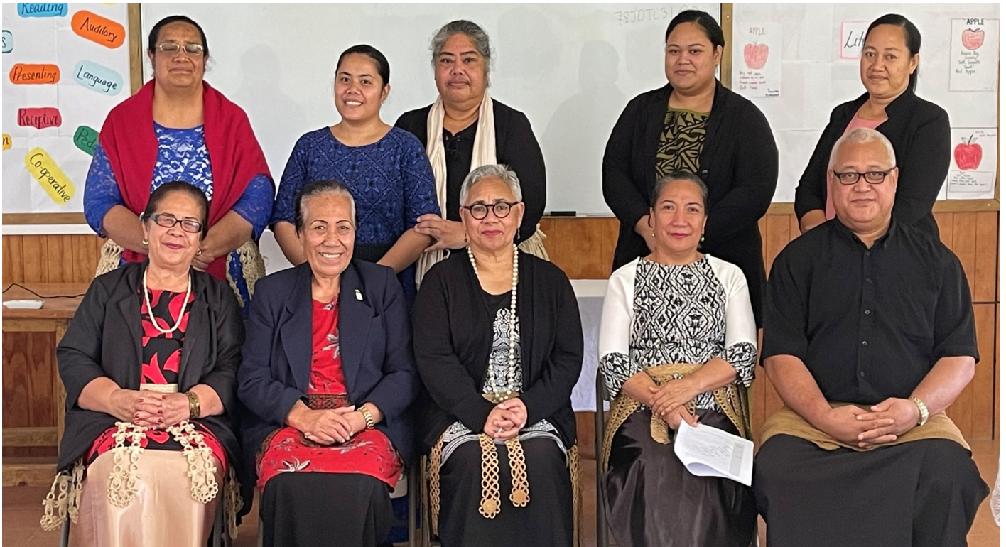
Participants who reviewed and validated NCACCL2 for TQF-registration

The National Certificate in Aged Community Care Level 2 (NCACCL2) was approved by the TNQAB Board of Directors for registration on the Tonga Qualifications Framework (TQF), on Thursday 17th June 2021. This national qualification