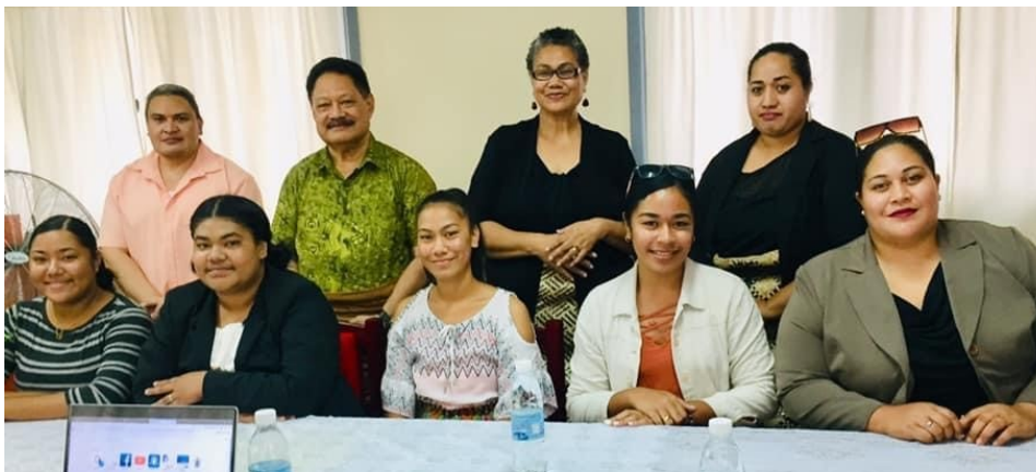
Panel members with students from the TIHE Certificate in Media and Journalism level 4